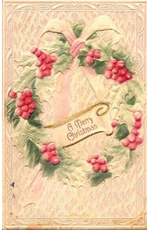
Post card from N J Falk to Oscar Falk, 1914 (front)