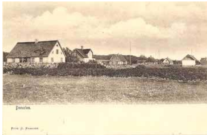
Post card of Domsten, Sweden

The Falks lived in Kulla Gunnarstorp and Domsten, near Helsingborg, Sweden.