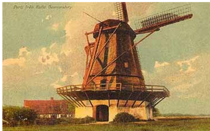
Post card of the mill in Kulla Gunnarstorp, Sweden circa 1900.