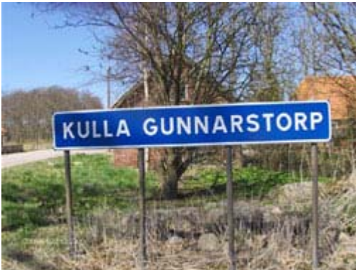
Sign at Kulla Gunnarstorp, Sweden