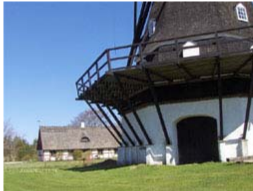
Mill and house