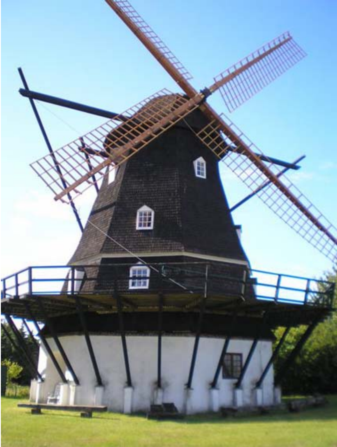
The windmill at Kulla Gunnarstorp in 2008.